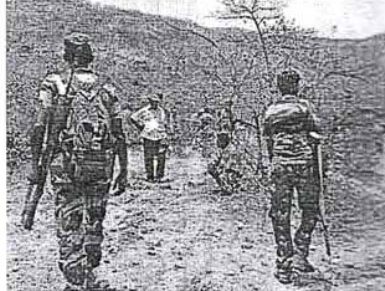
The Hindu The scene of encounter at Eethakunta in Seshachalam hills in Chittoor District on Tuesday.