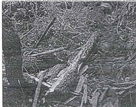
A file photo of red sanders logs, which are made ready for illegal transportation, in Seshachalam forests.

Twenty woodcutters from Tamil Nadu, found felling red sanders, were killed in an alleged encounter in the Seshachalam forest at the foot of