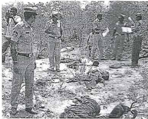
The Hindu The scene of encounter at Eethakunta in Seshachalam hills in Chittoor district on Tuesday.